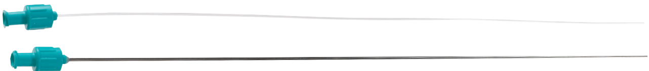
Individual parts of the SKATER® Nephrostomy Kit ▲